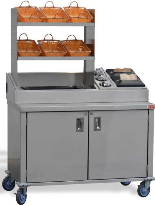
Shown: E1-ENC48-4V Patent Pending (Shown with inserts, sold separately)