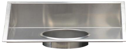
Shown: E1-RCL-2V Patent Pending