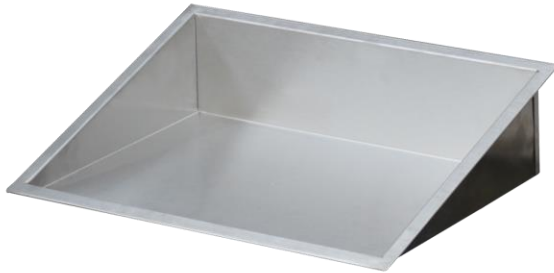
Shown: E1-FTA-2V Patent Pending