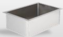
E1-DDF-1VH E1 System drop-in flush-mount countertop dispenser