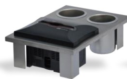
E1-1N52SD-1VH Napkin dispenser with (2) 30-oz stainless- steel containers