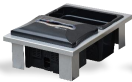
E1-1N51QP-1VH Napkin dispenser with quarter-size pan