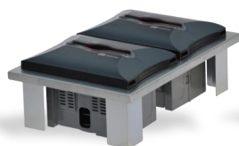
E1-2N5-2V Dual napkin dispenser insert