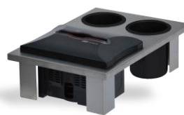
E1-1N52PCBLACK-1VH Napkin dispenser with (2) 30-oz plastic containers