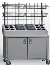
KIT-ENC48-452 E1 System 48" universal mobile dispenser/merchandiser