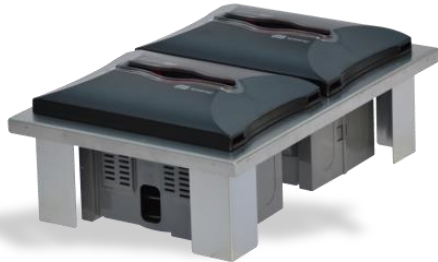
Shown: E1-2N5-1VH Patent Pending