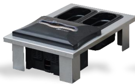
E1-1N52NP-1VH Napkin dispenser with (2) ninth-size pans