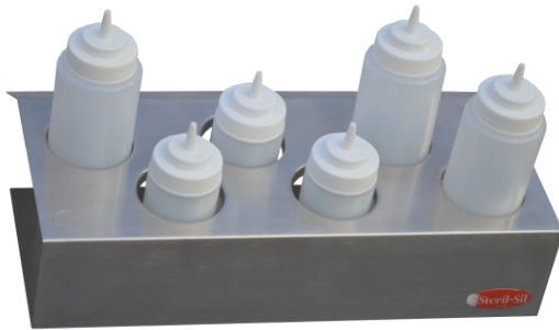
Shown: CV-BTL-6 (bottles not included)