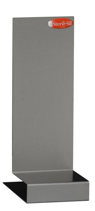
Model #: SAN-301