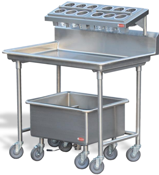
Model #: E1-LSS-2H