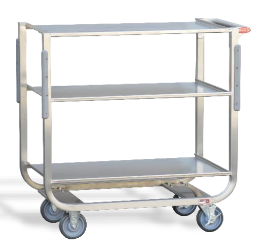
Model #: UTC-303 (UTC-303 shown includes bumpers, not shown)