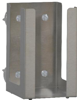
Model #: LID-301