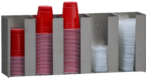
Model #: LID-305