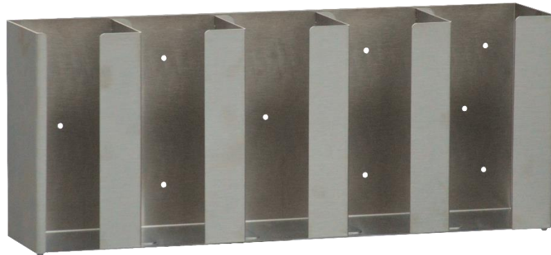
Model #: LID-305