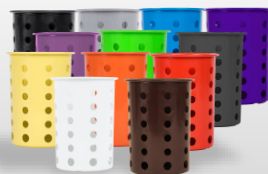
RP-25 series Plastic silverware cylinders available in 12 colors