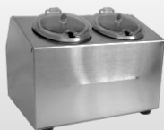
CC-LTC-2SW 2-hole insulated condiment dispenser