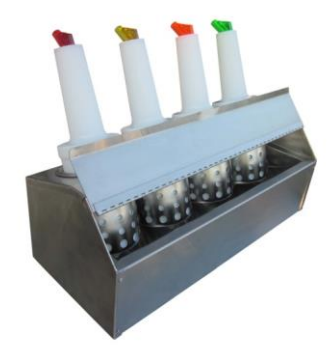
Model #: CC-LTC-4BR (Rear view, bottles not included)