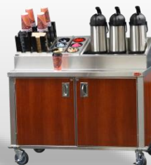
E1-ENC48-4V-LAM 48" E1 System mobile counter with accessories