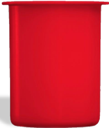
Model #: PC-700-RED