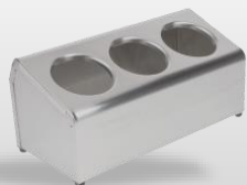
LTC-3 Countertop dispenser