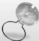
HC-20-X Hinged cover for Steril-Sil 30-ounce containers