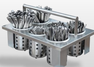
E1-BS6OE-SS E1 drop-in silverware basket