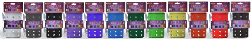
PN1 Cylinder Color Choices Visit our website for the latest color choices