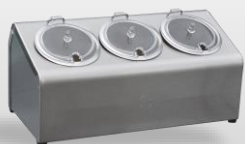
LTC-3SW Countertop dispenser with 30 oz. containers and lids