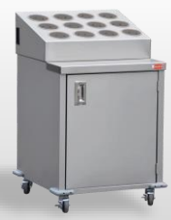
ENC24-12RP-GRAY 24" mobile silverware counter