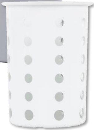
Model #: N-200