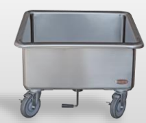
SK-2222 Flat-rack soak sink

See the classic dispenser, basket and E1 Silverware Handling System pages for additional accessories