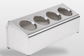
LTC-4 Countertop dispenser