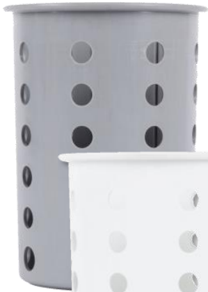
Model #: G-300