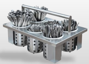
E1-BS60E-SS E1 drop-in silverware basket