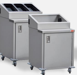
ENC24-1HP (Holds full-size hotel pan or combination of fractional pans)