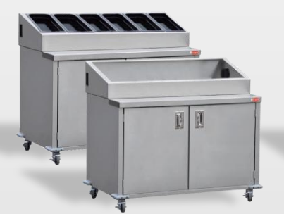
ENC48-2HP (Holds (2) full-size hotel pans or combination of fractional pans)

48"W x 24 ½"D x 39"H 8" convenience ledge 32 1/2" ledge height Stainless steel construction (2) locking/keyed doors (4) locking casters (4) corner bumpers Integrated handle grasps