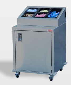
24" Beverage Counter (ENC24-1HP shown with (4) 1/6 size pans and (1) 1/3 size pan)