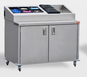
E1-ENC48-1HP2V (Holds (1) full-size hotel pan or combination of fractional pans and (2) E1 System inserts)