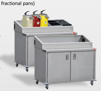
E1-ENC48-4V (Holds (4) E1 System inserts)