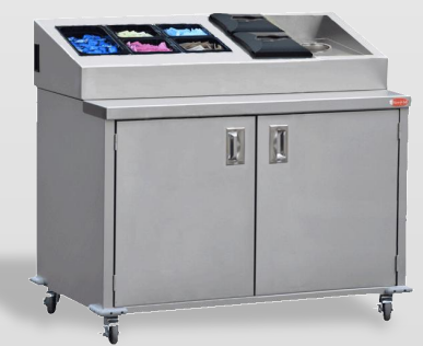
48" Beverage Counter with Trash Chute (E1-ENC48-1HP2V shown with (1) 1/3 size pan, (4) 1/6 size pans, E1-2N5-1VH napkin dispenser and E1-CHUTE-1V trash chute)